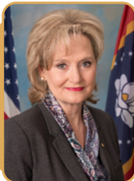
U.S. Senator Cindy Hyde-Smith (R-MISS.)